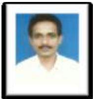
Ahok Ku Khatua

The present study concentrate on blood lead level (PbB) and lead in hair (PbH) in population living around Sargipalli lead mine area of Odisha which operated from 1983 to 2003 by the Hindustan Zinc Limited company. Five villages around the 5km were taken as case study area for sampling as shown in the trace map. The village Bharatpur is nearby to mining site and other villages are of 1km distance from each other in between 5km radius. The village Jhimirmaul